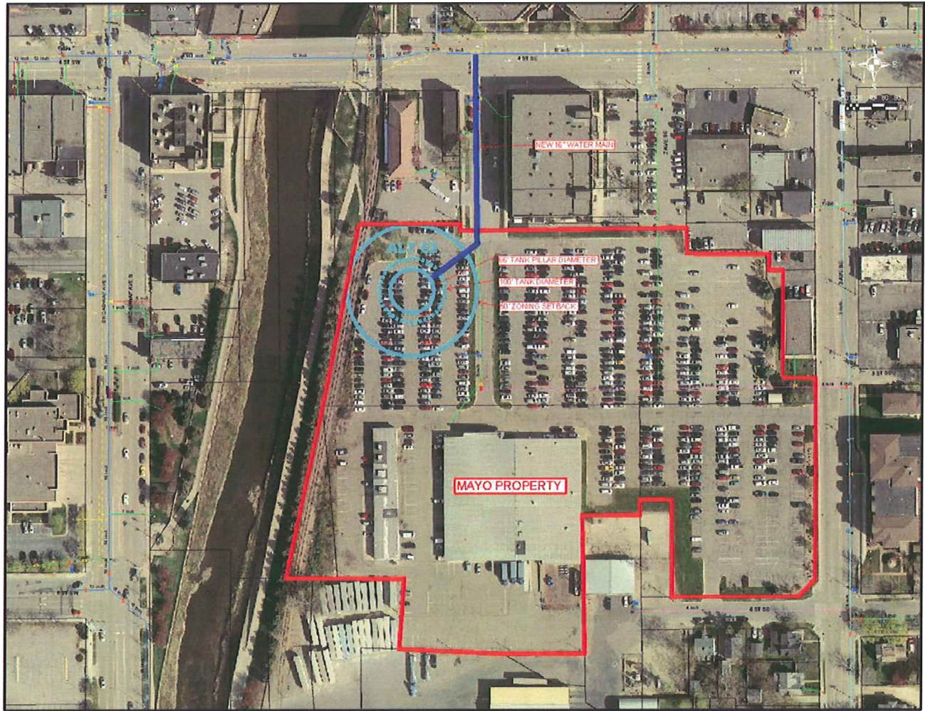
Reservoir Replacement Alternative E2 (Mayo Fullerton Property south of 4 St SE and west of 3 Ave SE) A 16" Watermain would be constructed north from the Hydropillar to 4 St SE.