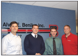
Benike Construction ESP: Nietz Electric