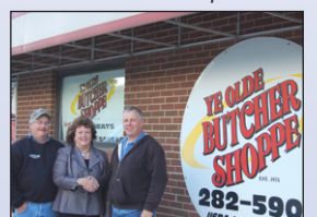
Ye Olde Butcher Shoppe ESP: Capelle's Electric