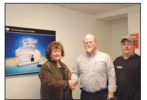
Waters Medical Systems ESP: Capelle's Electric