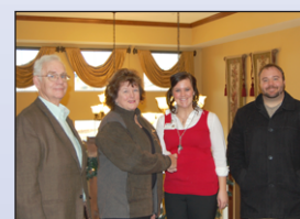
The Homestead at Rochester ESP: Judisch & Judisch Ent.