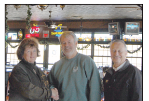
Whistle Binkies on the Lake ESP: Harty Mechanical