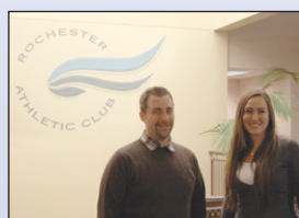
Rochester Athletic Club ESP: Graybar