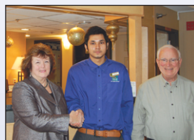
Quality Inn & Suites ESP: Winkels Electric