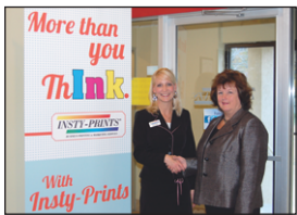
Insty Prints ESP: Tonna Mechanical