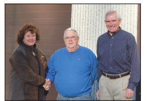
Vahalla Management Association ESP: Nietz Electric