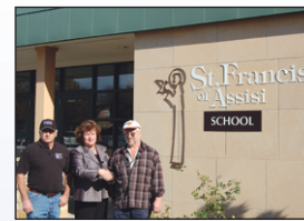
St. Francis Catholic School ESP: Nietz Electric