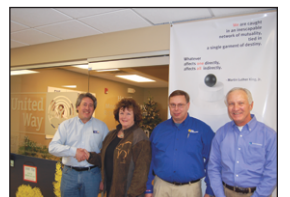
United Way ESP: Mr. Electric