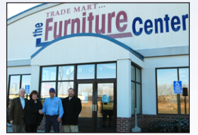
Trade Mart Furniture ESP: Judisch & Judisch Ent.