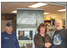
History Center of Olmsted County ESP: Nietz Electric