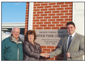
Macken Funeral Home ESP: Winkels Electric