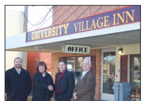
University Village Inn ESP: Judisch & Judisch Ent