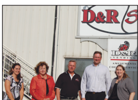
D&R Star ESP: Viking Electric