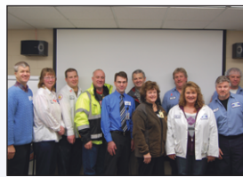
Pace Dairy ESP: Werner Electric