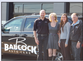
Babcock Auto ESP: Premier Lighting