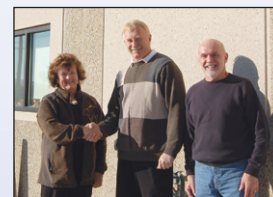
T & R Development ESP: Accord Electric