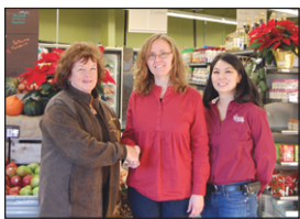
Good Food Store Coop ESP: St. Cloud Refrigeration