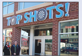
Top Shots! Bar, Inc. ESP: Tonna Mechanical