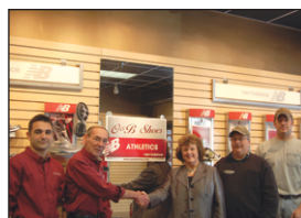
O & B Shoes ESP: Capelle's Electric