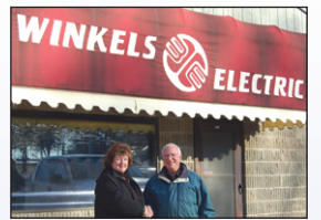
Winkels Electric ESP: Winkels Electric