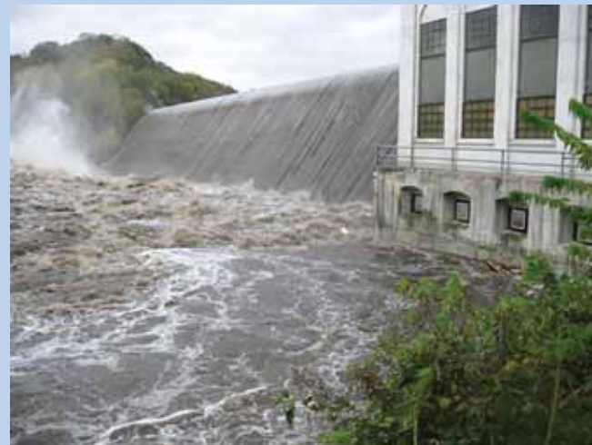
Heavy rainfall swelled the water level of Lake Zumbro to elevation 928.61 dam datum, approximately 9 feet above normal summer lake level.