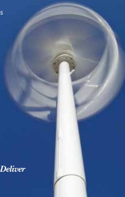
Cascade Meadow's Vertical Axis Wind Turbine